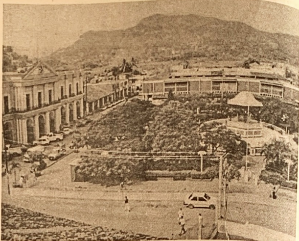
Panoramic view of downtown Tehuantepec

The procession is a wonder to behold. Ox drawn wagons are beautifully arranged with trees and flowers, and look like rolling gardens. From them young women throw treats to the crowd. The procession, and indeed every detail of the entire vela, is directed by the