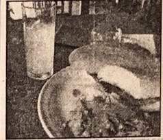
ROYAL a french bistrof