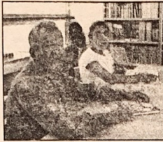
Oaxaca Children's Library